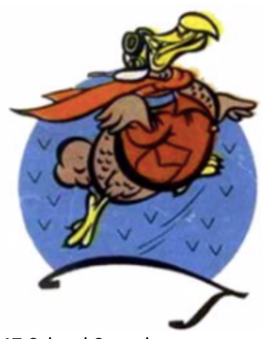
47 School Squadron